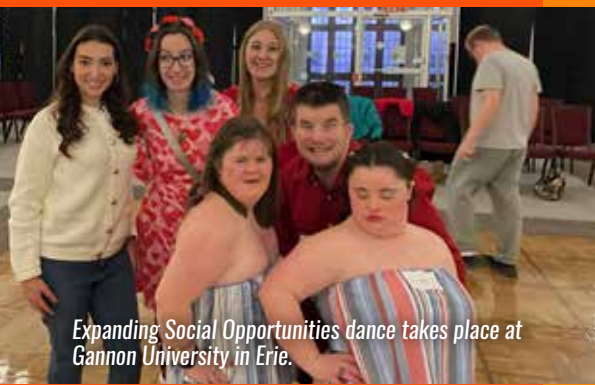
Expanding Social Opportunities dance takes place at Gannon University in Erie.