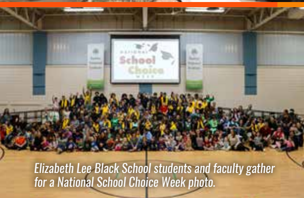
Elizabeth Lee Black School students and faculty gather for a National School Choice Week photo.