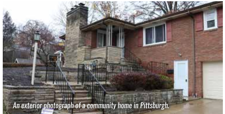
An exterior photograph of a community home in Pittsburgh.

For the people with disabilities in Barber National Institute's care, staying in their home requires more than just routine maintenance; it demands essential renovations that directly